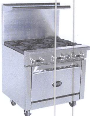
RR-6 with optional casters

Models: RR-6 RR-4G12 RR-2G24 RR-G36 RR-4-36 RR-4RG12 RR-6SU RR-4GT12 RR-2GT24 RR-GT36